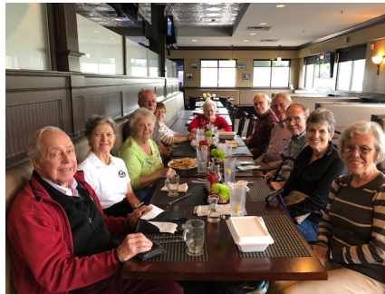
Older, Wiser, Livelier Seniors